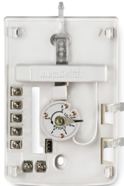
Inside of Model 500 Shown