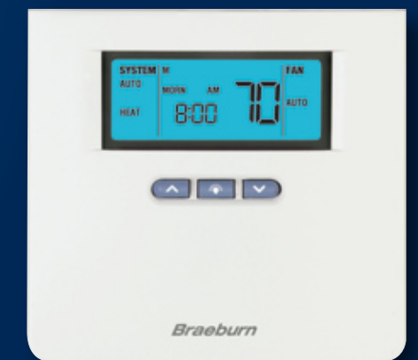
5400 - Up to 3 Heat / 2 Cool • Universal Auto Changeover • Humidification, Dehumidification and Fresh Air Control • 7 Day, 5-2 Day Programming or Non-Programmable