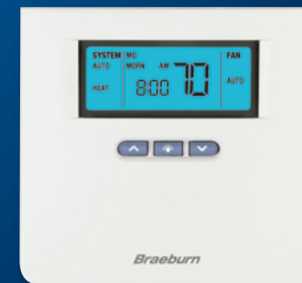
5300 - Up to 2 Heat / 2 Cool • Universal Auto Changeover • 7 Day, 5-2 Day Programming or Non-Programmable