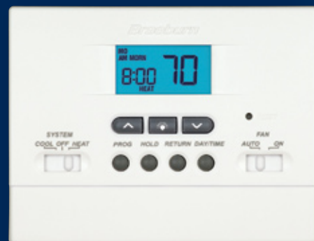
2000NC - Single Stage Heat / Cool 5-2 Weekday/Weekend Programming

Pre-programmed set points save up to 30%