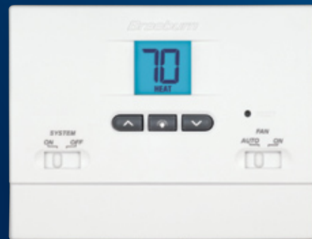
1005NC - Universal Heat Only or Cool Only