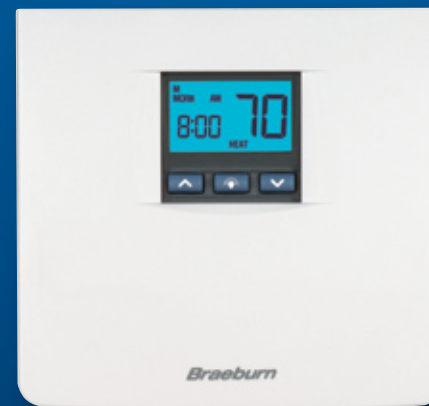
5000 - Single Stage Heat / Cool 7 Day or 5-2 Day Programming