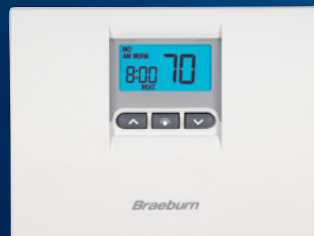
2000 - Single Stage Heat / Cool 5-2 Weekday/Weekend Programming