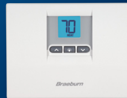
1200 - Multi-Stage 2 Heat / 1 Cool