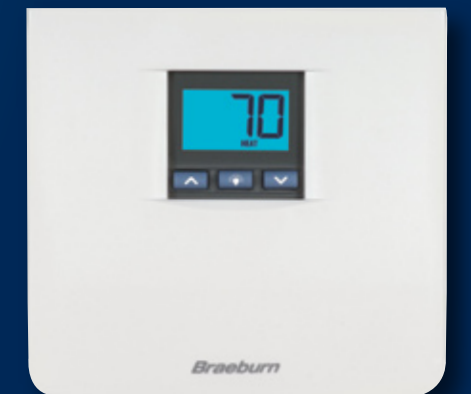
3000 - Single Stage Heat / Cool with Recirculating Fan Mode