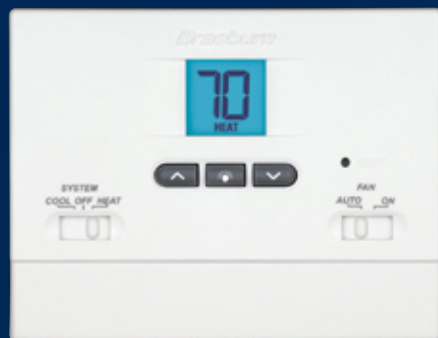
1000NC - Single Stage Heat / Cool