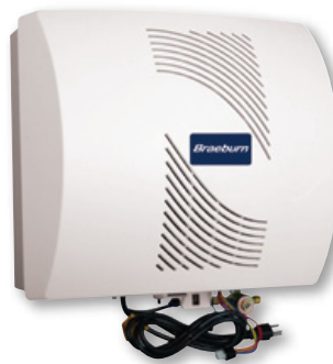
Fan Powered Humidifier 220700 / 220750