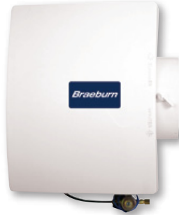
Bypass Humidifier 220600 / 220650