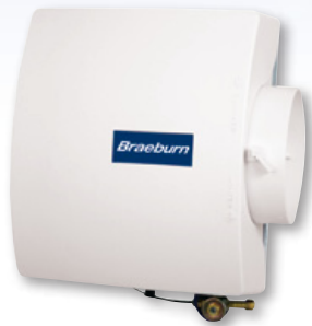
Bypass Humidifier 220500 / 220550